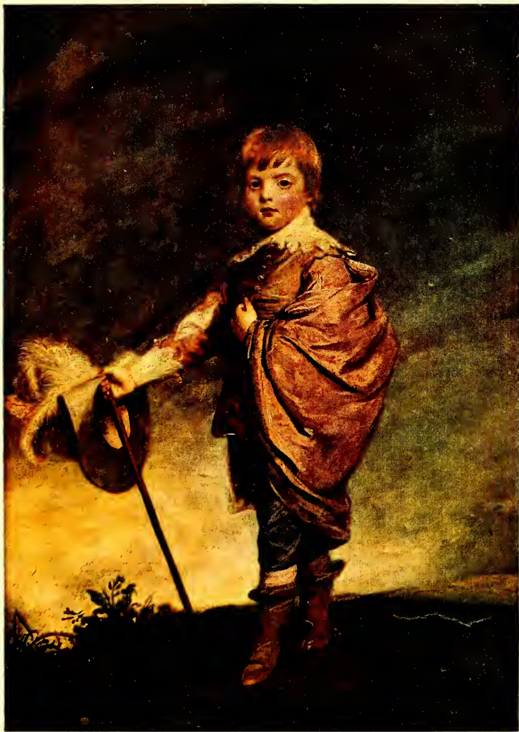
THE DUKE OF GLOUCESTER.

From the picture by Sir Joshua Reynolds, in Trinity College, Cambridge.